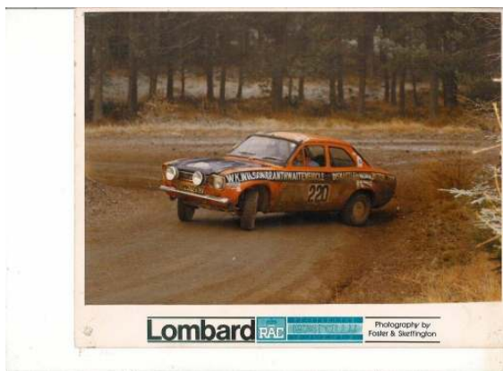
Lombard RAC