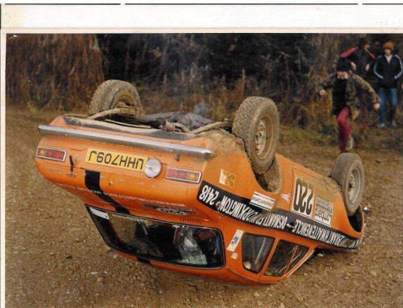
Lombard RAC

Malcolm went on to be a works driver of various Fords, Vauxhalls, Metro 6R4s, an Audi Quattro and other cars, he founded his own company later to become M sport and ran the works Ford